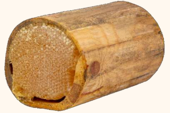
Billet Karakovan (Wood)