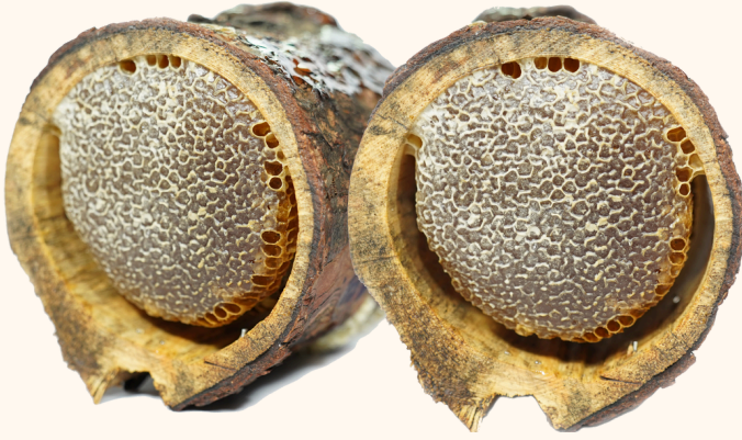
Billet Karakovan (Tree)

We collect the most natural Karakovan Honey from our beekeepers, which differs from other honeycomb honey thanks to the real wax in the comb.