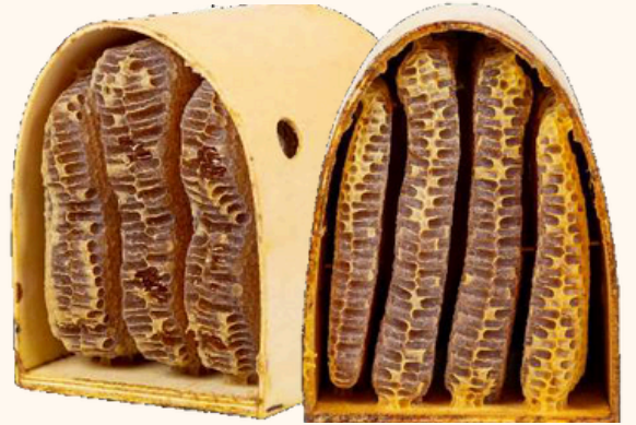
Billet Karakovan (Tunnel)