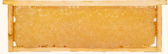
Small Frame Honeycomb Honey