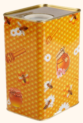
Tin Weight: 5 kg