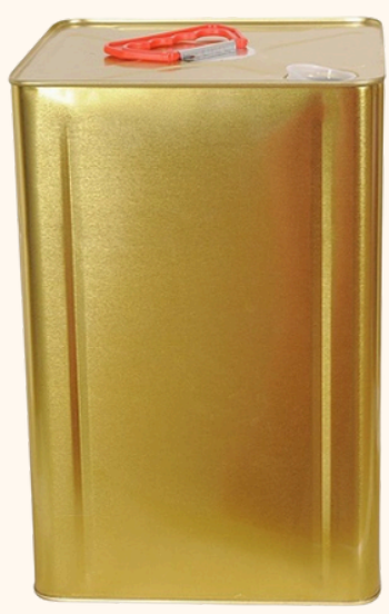
Tin Weight: 25 kg