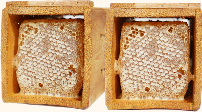
Billet Karakovan (Wooden Square)