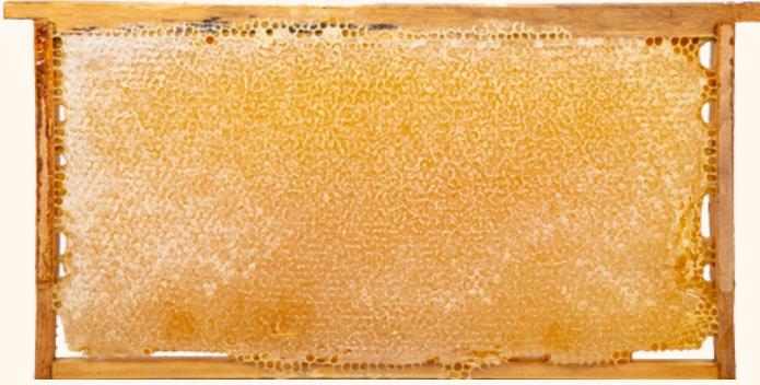
Big Frame Honeycomb Honey

The best quality of honeycomb honey, which is the most important part of honey production, is collected by our beekeepers and offered to our valued customers in a reliable way.