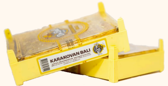
Cassette Box Honeycomb Honey