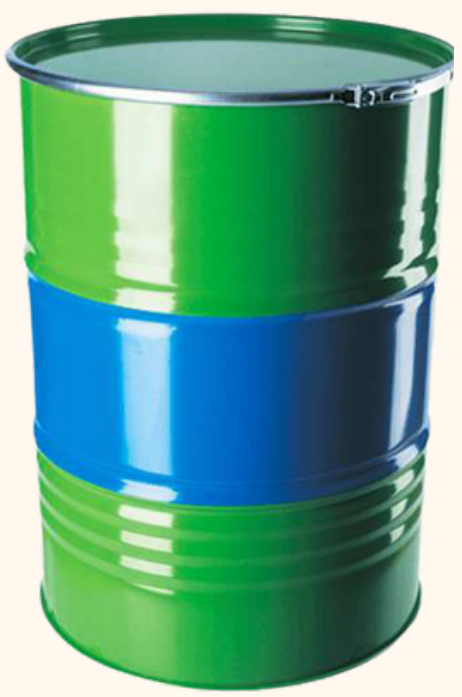
Barrel Weight: 290 kg